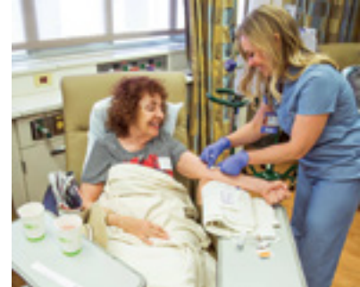
(L) The future home of the UCSF-John Muir Health Cancer Center. (R) Oncology patient at John Muir Health.